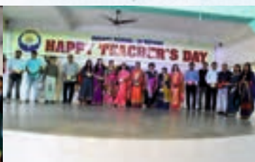
Activities carried out by ROSA-Baroda