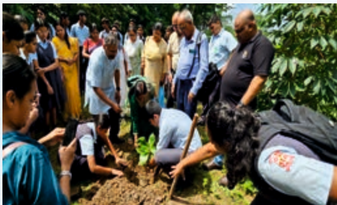
Tarumitra Program with LAA members held on 05th October 2023