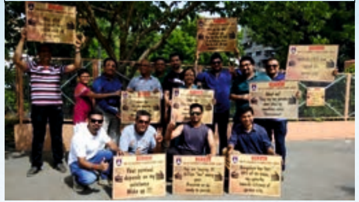
SAVE TREES AWARENESS CAMPAIGN