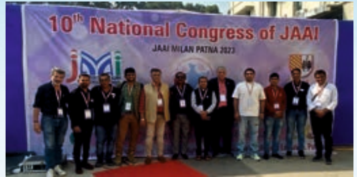
JAAI TEAM AT 10TH NATIONAL CONGRESS OF JAAI, PATNA