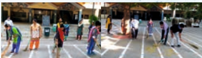
GREEN ENVIRONMENT DRIVE