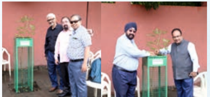
DONATED TREE GUARD TO INSTITUTE