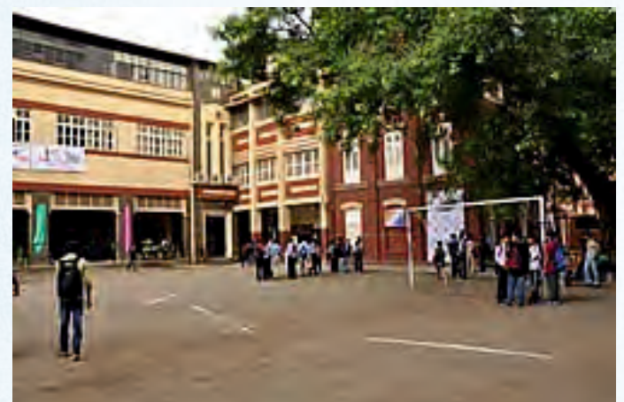
St Mary's School in Surat