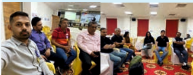
JAAI AGM AT SURAT DURING 6TH JAAI WEST ZONE CONGRESS