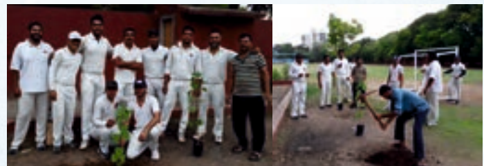
TREE PLANTATION BY TEXAS CRICKET TEAM