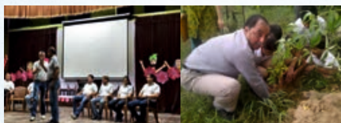
Activities carried out by APX-Ahmedabad

A Volleyball Tournament was organized wherein the alumni associations participated. This was to develop better bonding & networking between the representatives and associates.