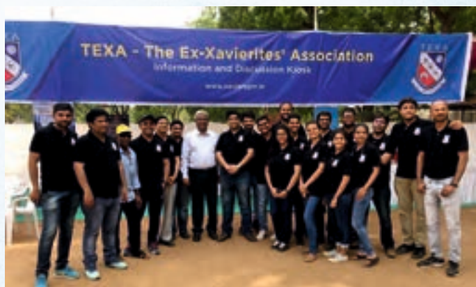
Activities carried out by TEXA-Gandhinagar