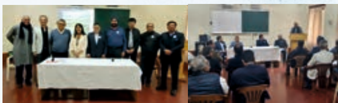
JAAI CENTRAL ZONE Meeting was hosted by LAA at Loyola School on 15th January 2023