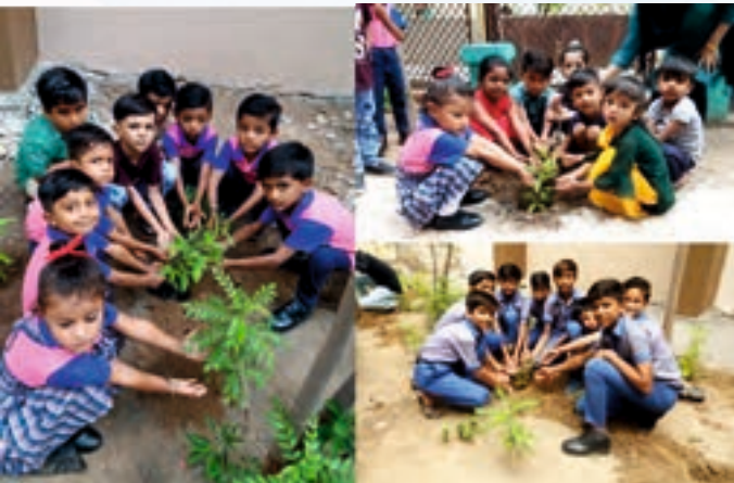
TREE PLANTATION GREEN CAMPUS DRIVE