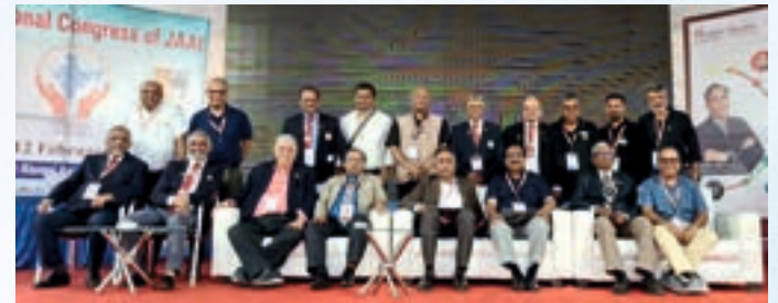
JAAI TEAM AT 10TH NATIONAL CONGRESS OF JAAI, PATNA