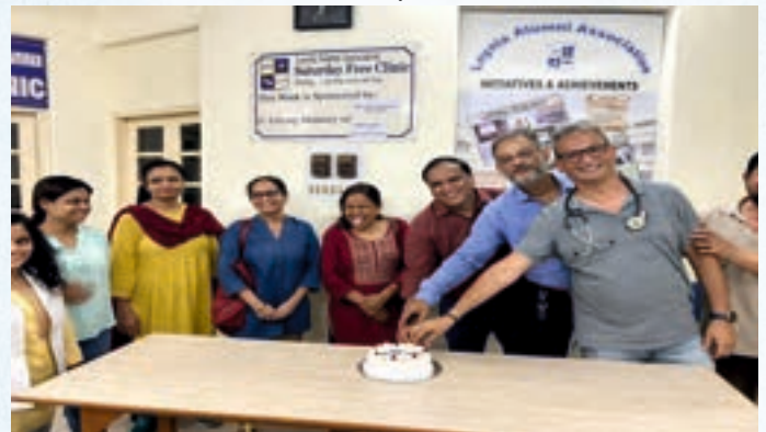
Cake cutting Program at LAA Saturday Free Clinic on the occasion of "Doctors Day" on 1st July 2023.