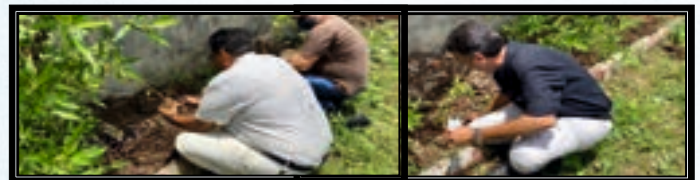
ENVIRONMENT DAY CELEBRATION