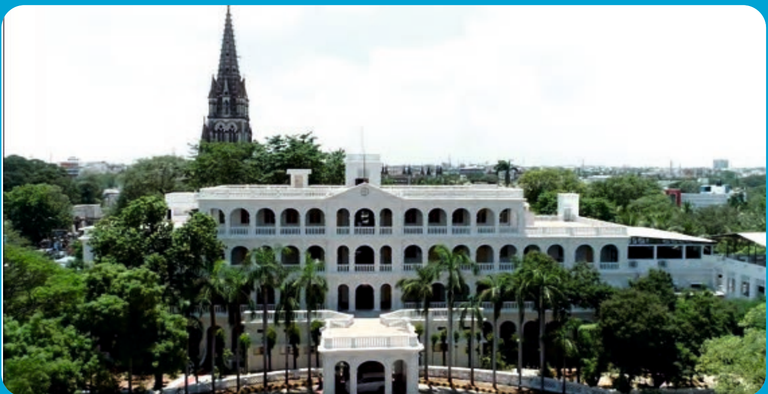
St Joseph's College, (Autonomous) Tiruchirappalli