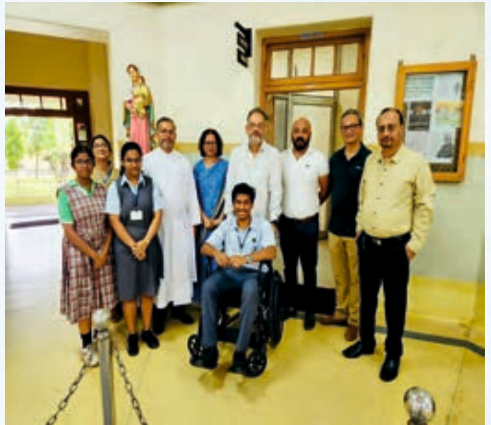
A Wheelchair was donated by LAA to Loyola School on 22 June 2023

L.A.A. has paid Apollo Speciality Hospital in Kolkata Rs. 75,000/- towards treatment but sadly he passed away a week later.