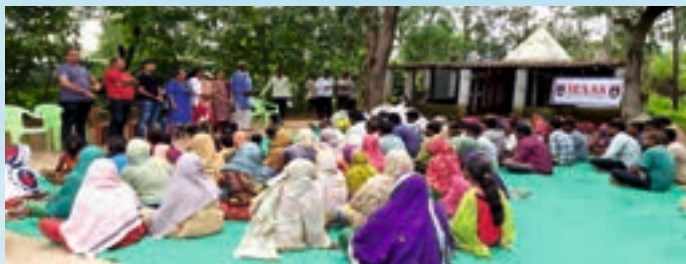
Medical and relief Camp in Rural Area