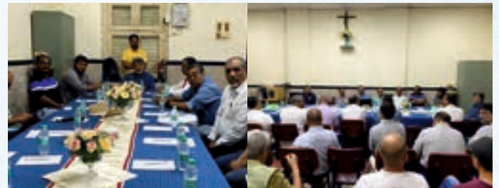
JAAI TEAM AT JAAI WEST ZONE COUNCIL MEETING, MUMBAI