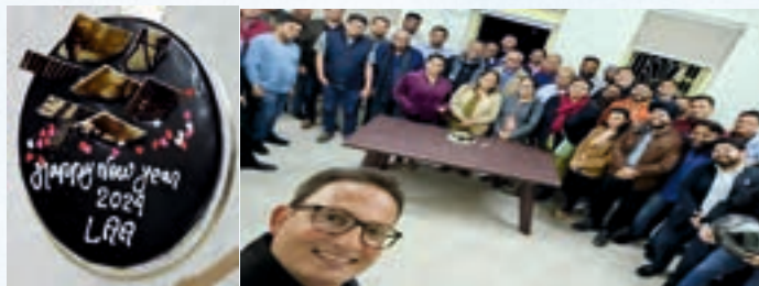
LAA members were meet the Old Fathers & Brothers of Jesuit Community in XLRI on 24th December 2023 “NEW YEAR 2024” Cake cutting Program at LAA