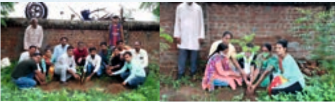
Activities carried out by KEXA, KALOL TREE PLANTATION GREEN CAMPUS DRIVE