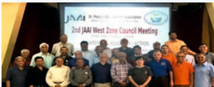
JAAG-West Zone Council Meet held at St Mary's Mumbai. The Gujarat team was also present for this meeting