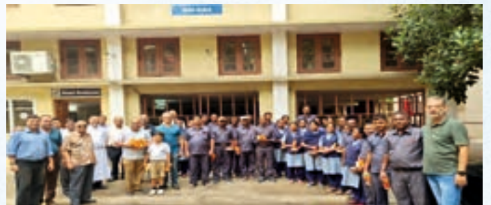
May Day Program on the occasion of "Labour Day" with Loyola School Administrative Staff on 1st May 2023. 38 School Staff were present.