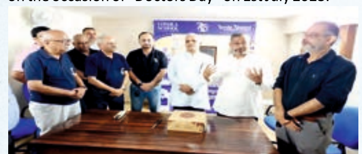
Cake cutting Program for "Feast Day" on the occasion of Loyola Day at Saturday Free Clinic on 29th July 2023.