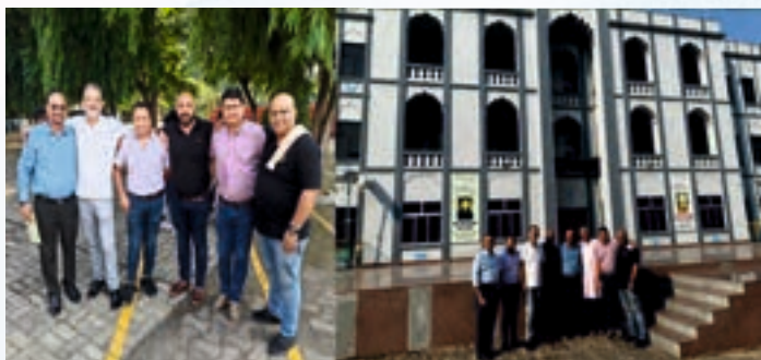
JAAI Central Zone Meeting was held on 8th October 2023 at Dhanbad 7 LAA members attended the day long Program