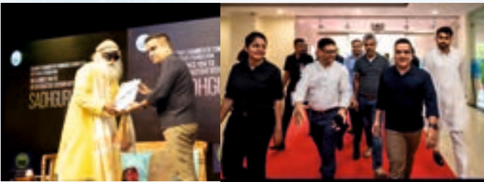
APX partnered many leading associations and institutes like GCCI, HLCCA, JITO, CA association & GUJARAT POLICE etc.