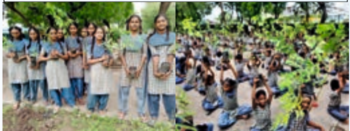
TREE PLANTATION MORE THAN 1400 PLANTS PLANTED

JAAI-West Zone Council Meet held at St Mary's Mumbai. The Gujarat team was also present for this meeting