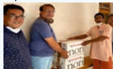
Medical Kit Distribution