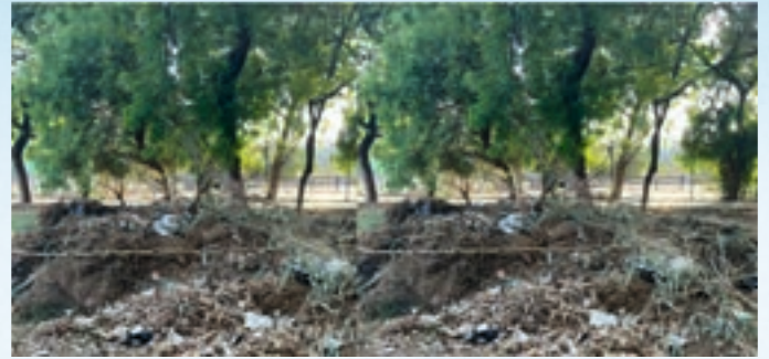
The campus is being cleaned by the management and the waste too will be used as per environment norms.