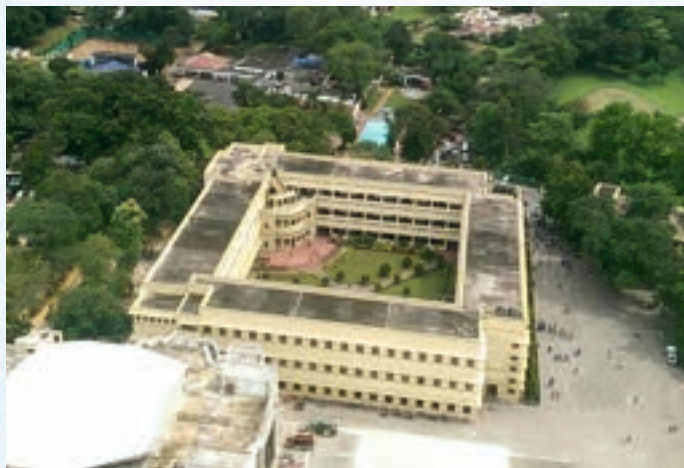
Loyola High School, Jamshedpur