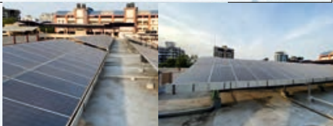
SOLAR ROOFTOP GENERATING 165 kWh PER DAY