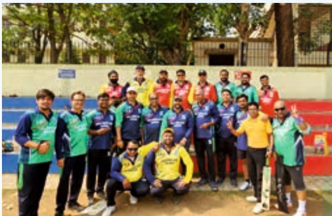
Saturday Free Clinic with Doctors & Volunteers (LAA members) on 6th January 2024