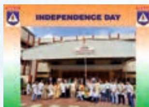
Activities carried out by TEXAS-Surat

JAAG took an initiative to propose and form an alumni association at Sevasi Baroda under the name of "XAATIS" (Xavier Alumni Association Technical Institute Sevasi)