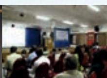
Activities carried out by TOXA-Ahmedabad