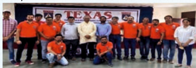
TEXAS Blood Donation Camp