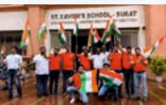
Aazadi Ka Amrit Mahotsav