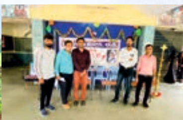
Activities carried out by KEXA-Kalol